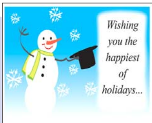
V.E.F. Project Page 1

FIRST CLASS PRESORT U.S. POSTAGE PAID Lansing, MI Permit #485